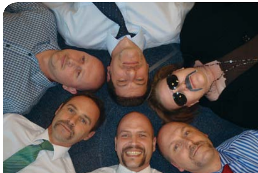
Robert Half employees in Birmingham, England — and a San Ramon-based colleague — showcased their support of men's health issues by sporting real — and fake — mustaches.

Founded in 1988, Women's Initiative for Self-Employment (WISE) teaches high-potential, low-income women how to start or expand their own businesses, creating new jobs in their local communities. Robert Half has supported the organization since 2005 through a corporate donation and leadership support on both the national governing and New York boards of directors. Each December, graduates of WISE's business-training programs also are invited to participate in our annual holiday bazaar, hosted in our Corporate Services location in San Ramon.