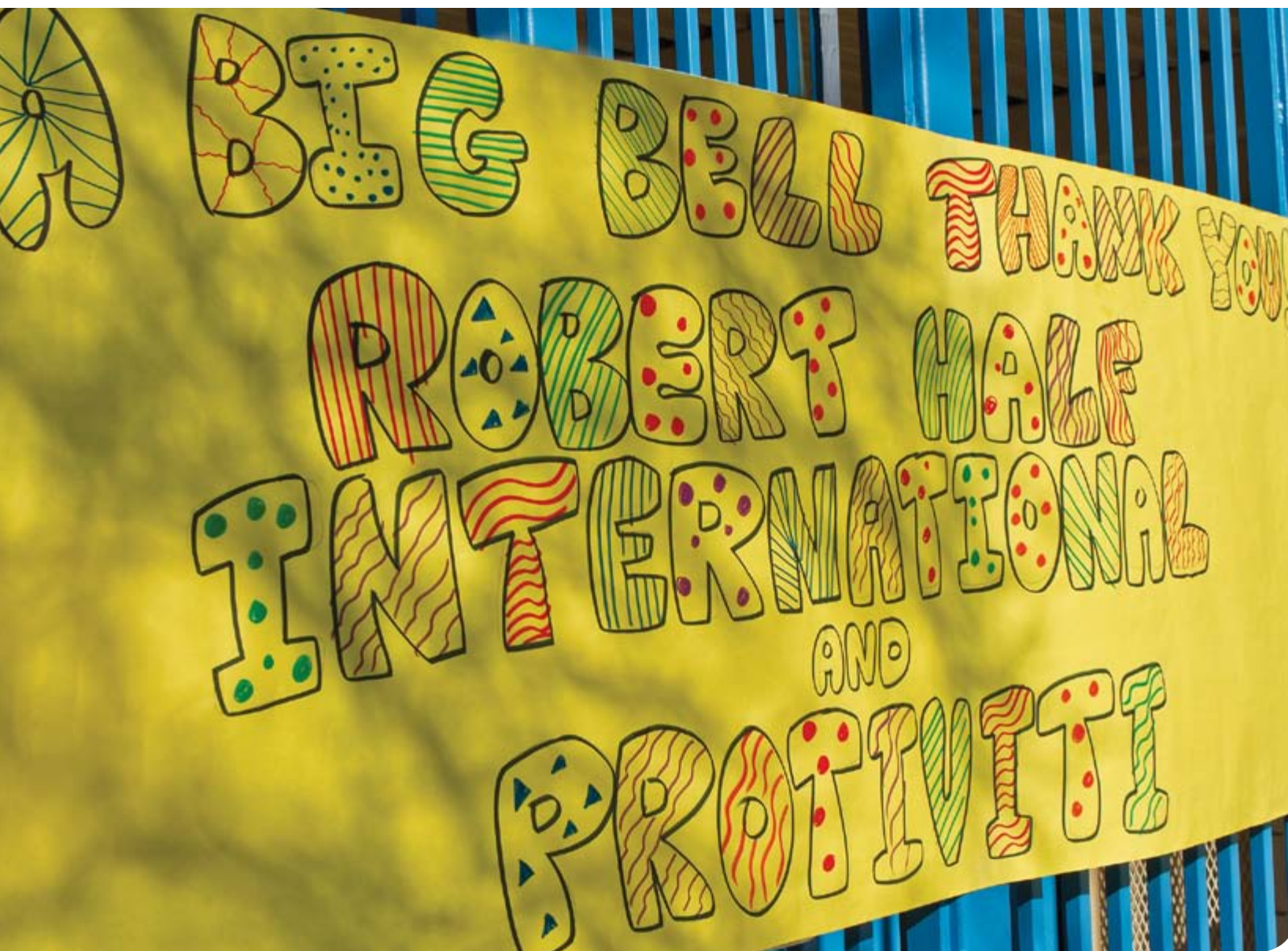
Students at Rex Bell Elementary School in Las Vegas showed their appreciation for our team's beautification efforts in January 2013.