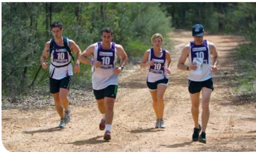
Robert Half teammates in Sydney participated in the eight-hour Great Adventure Challenge to support Starlight Children's Foundation.