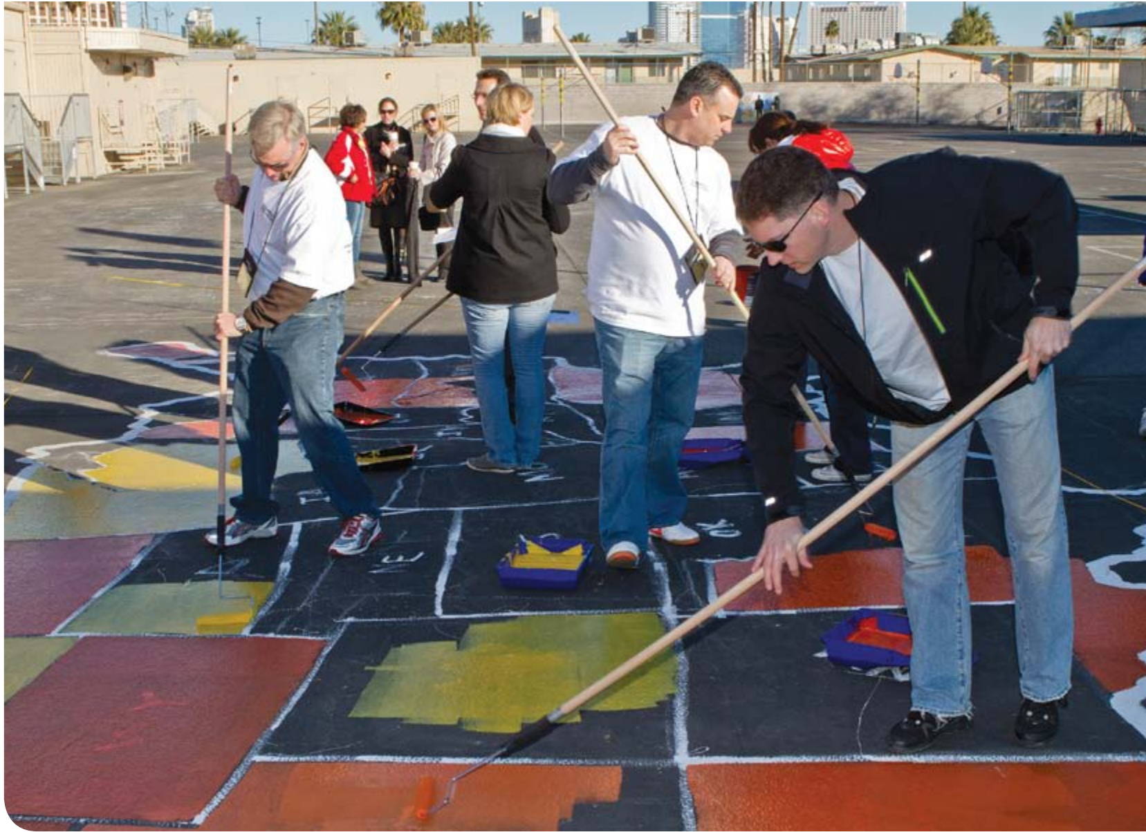
Robert Half and Protiviti executives helped turn a playground into a geography lesson during a team volunteer event in Las Vegas.