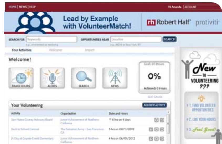
Robert Half's VolunteerMatch site allows employees to find a nearby volunteer activity and record their hours.

Our employees are active in supporting disaster-relief efforts around the globe. Robert Half provides an annual corporate grant of $100,000 to the American Red Cross, as well as a donation to the Canadian Red Cross, to assist where the need is the greatest. In addition, our offices have embarked on grassroots efforts to help areas hard hit by disaster, such as during Superstorm Sandy.