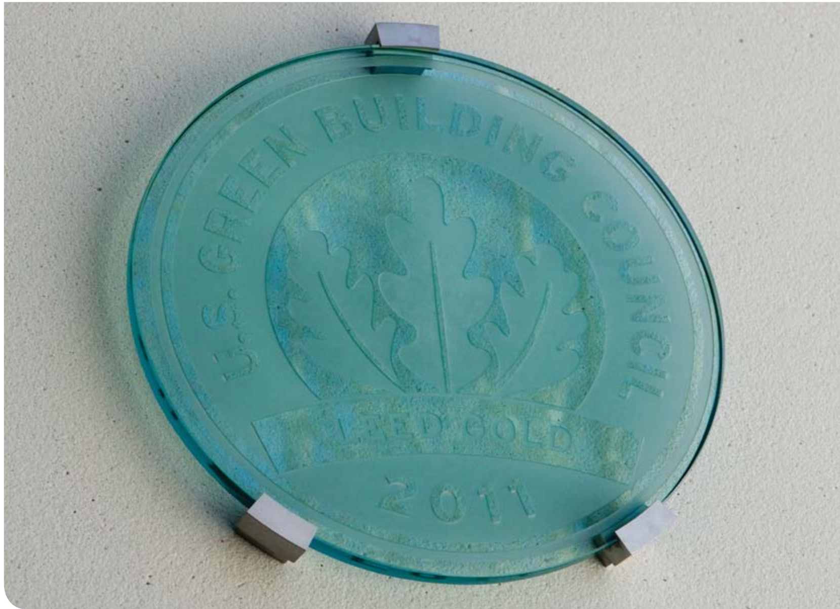
The building that houses our largest leased space, the San Ramon, Calif., Corporate Services location, was LEED Gold Certified in 2011.

We continue to explore ways to minimize our impact on the environment through new and existing programs.