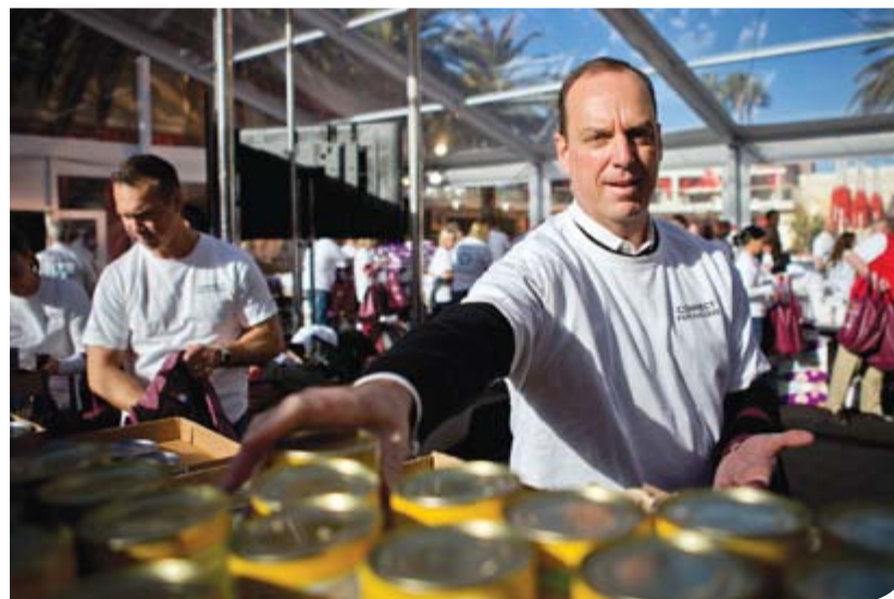
Robert Half and Protiviti senior leadership participated in various volunteer events during the year.