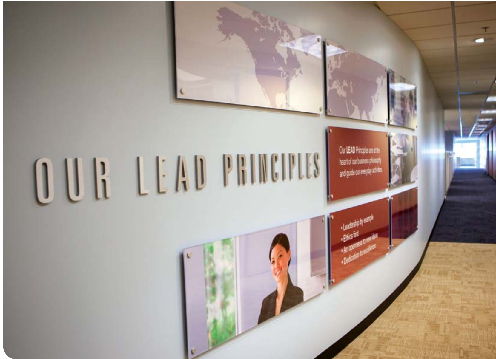
Our LEAD Principles, shown on display in our San Ramon, Calif., Corporate Services location, guide the actions of our employees around the world.

Attracting top internal talent allows us to provide exceptional service to our clients and the professionals we place.