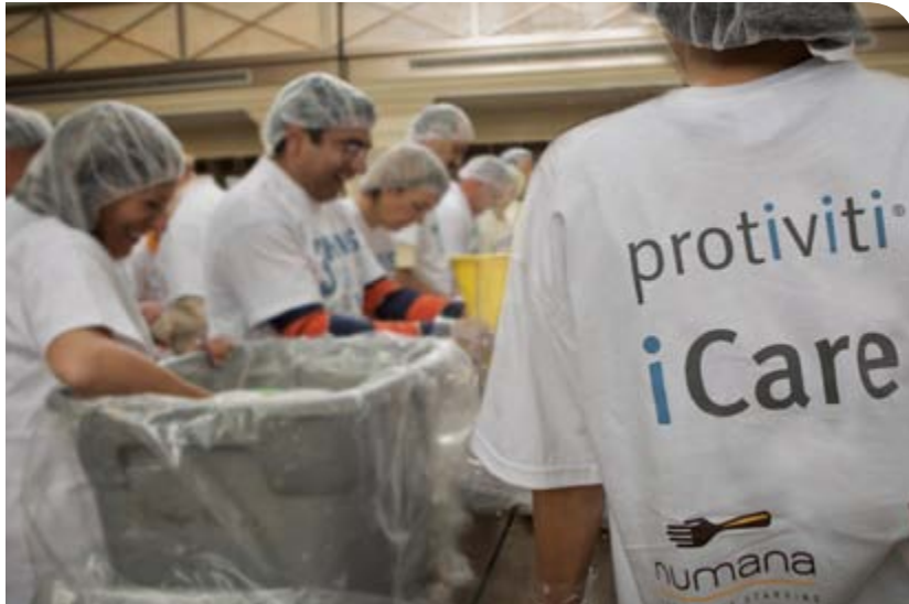
At their annual leadership conference, Protiviti managing directors packaged nutritious meals during a team-building event benefiting Numana, Inc.