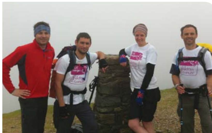
Information Technology team members in our Birmingham, England, Corporate Services office hiked and climbed their way to fundraising success for CLIC Sargent.

As the organization's industry-exclusive staffing services partner, Robert Half has focused our support on career-development tools, particularly for members of the Professional Women's Group (PWG), an international networking association for Dress for Success clients. Robert Half provides participants with access to job-skill evaluations