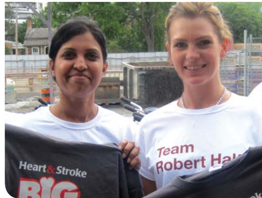
North York, Ontario, employees demonstrated teamwork by helping to pedal a 29-person bicycle to raise funds for the Heart & Stroke Foundation of Canada.

Our North York, Ontario, office and surrounding locations took team-building to a new level: In June 2012, 29 Robert Half colleagues pedaled a single bicycle in the Heart & Stroke Big Bike event, which benefits the Heart & Stroke Foundation of Canada. Robert Half Canada also supports the organization through an annual denim day, during which employees are invited to wear jeans to work in exchange for a donation to the foundation.